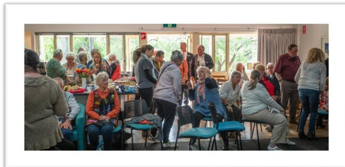
Volunteers, dignitaries, supporters and community groups join in BHCI's 30-year Celebration event.