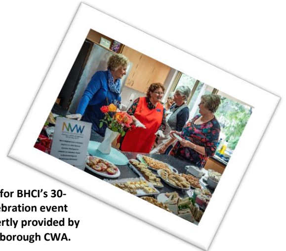
Catering for BHCI's 30-year Celebration event was expertly provided by the Dunsborough CWA.