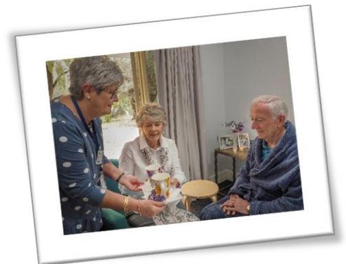
Hospice volunteers provide emotional, social, cultural and spiritual support.