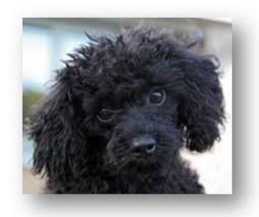
Jethro – a therapy dog joined the Hospice Volunteer Team in 2018

The BHC Hospice Unit volunteer team was joined by 17 new recruits this year who've all been welcomed into the fold and settled into the role extremely well. In addition to our human volunteers, the team welcomed our very first therapy dog – Jethro. The patients, visitors and staff have all enjoyed Jethro's visits and he's been able to put a smile on the faces of everyone he visits.